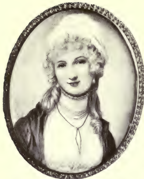
LADY AUGUSTA MURRAY WIFE OF THE DUKE OF SUSSEX BY RICHARD COSWAY R.A.